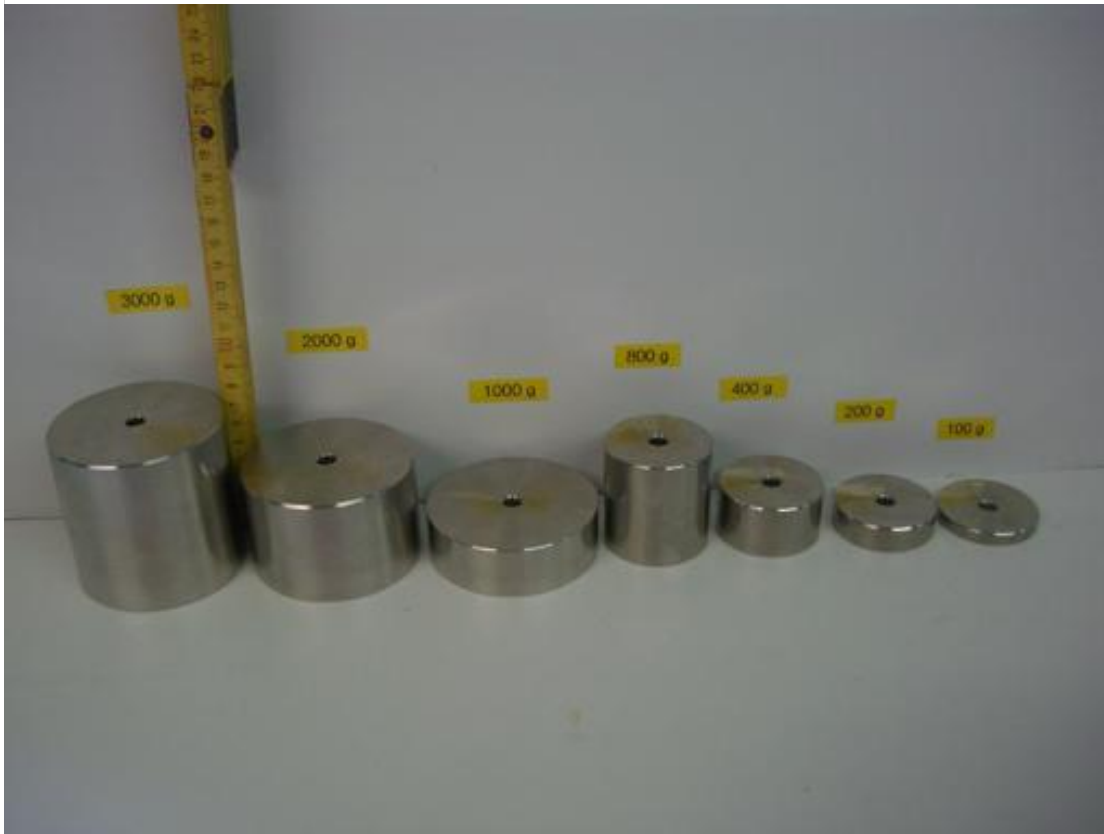
Figure 2: Used weights provided by the kjVI.