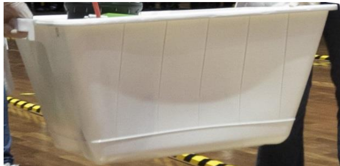
Figure 1: Transport box.