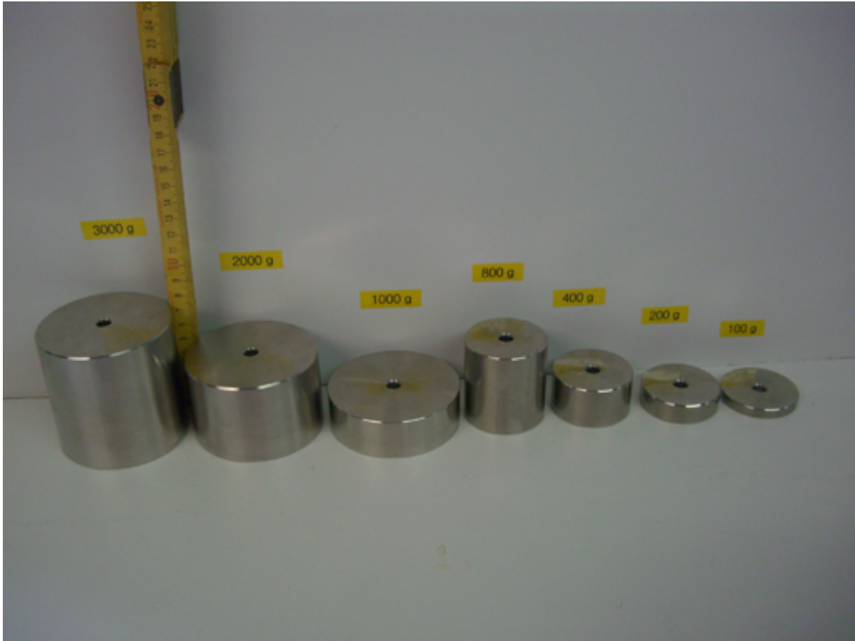
Figure 2: Used weights provided by the kjVIs